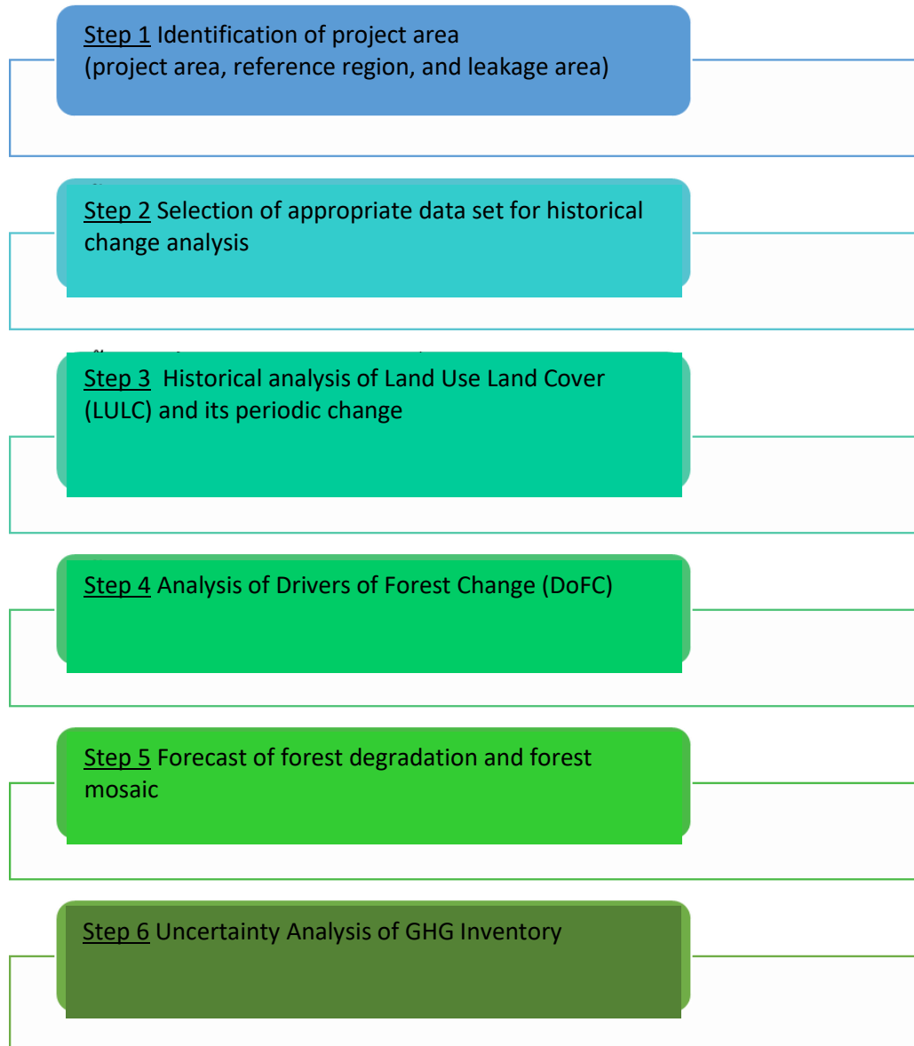
Figure 1 Procedure for consideration of baseline and greenhouse gas emissions